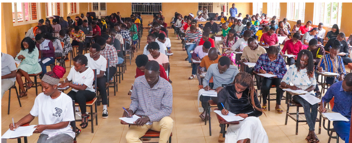
Part of the students doing their examintaion in a large number

“I’m hopeful and aiming for a First Class this semester.”